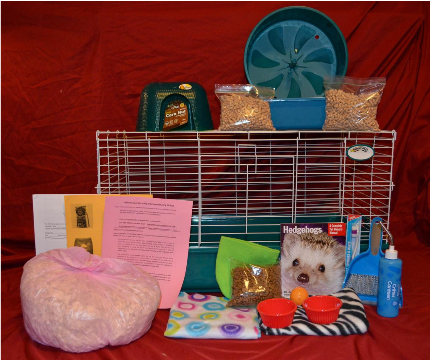
Cage and supplies