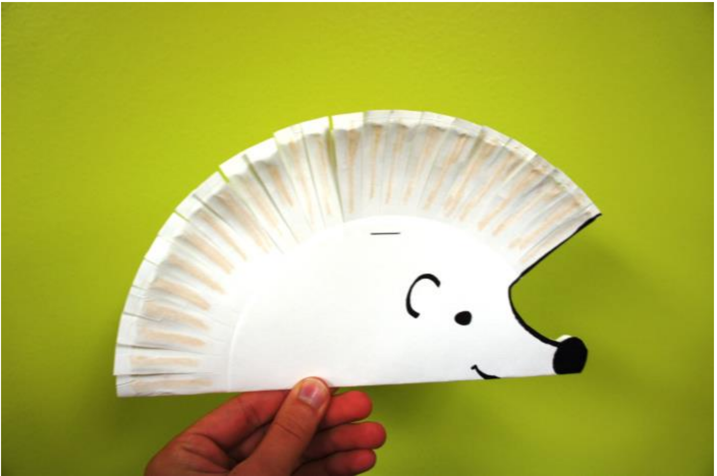
Paper plate hedgehog craft project