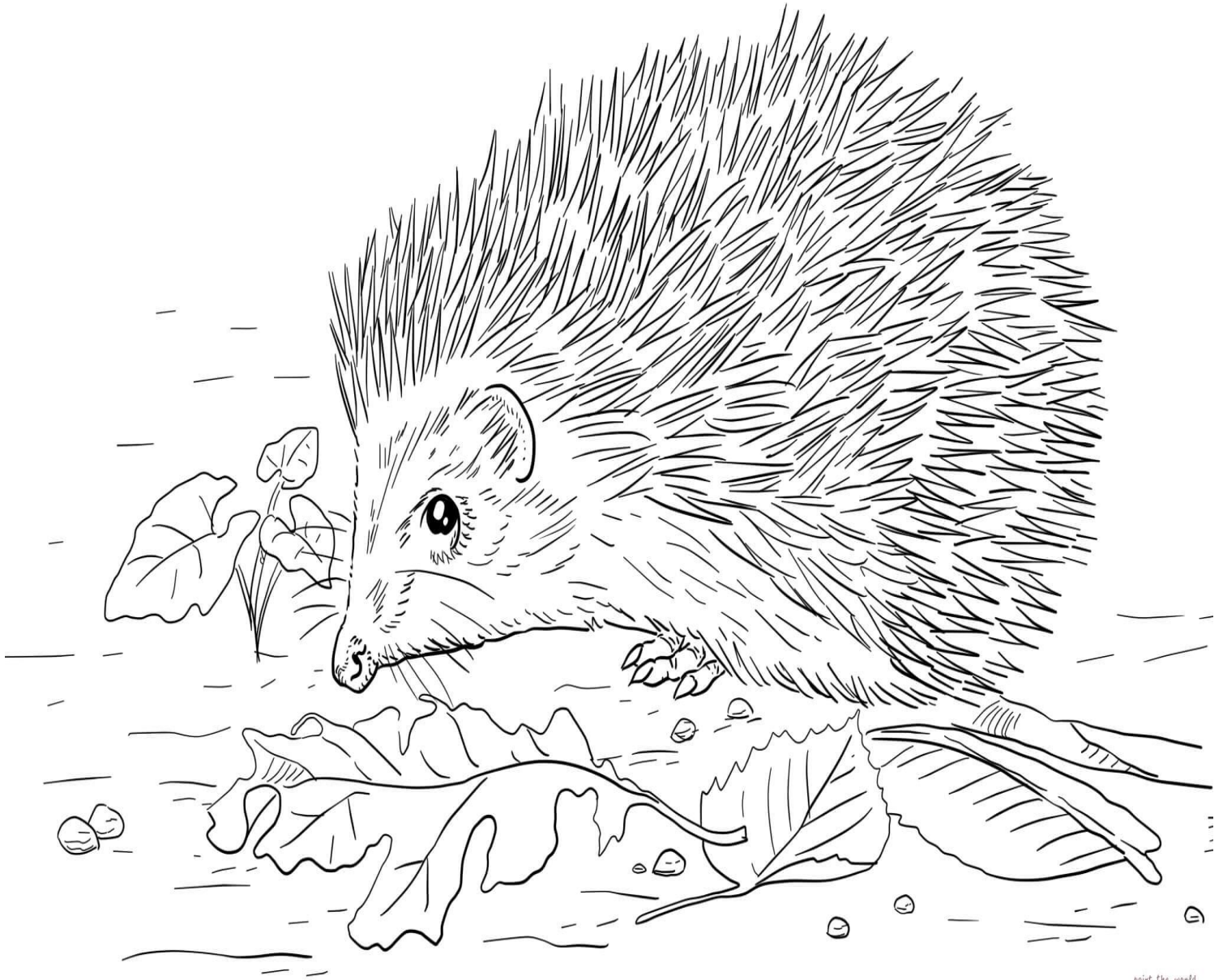
Coloring sheet hedgehog