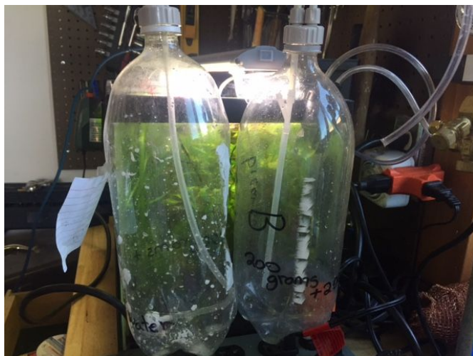
CO 2 Reactor

Our first task was to build a contraption that would produce carbon dioxide that we could add to the aquarium. I showed students that when certain acids like citric acid and a solution of baking soda were combined carbon dioxide was produced. They took this knowledge and came up with ways that the CO 2 could be added to the aquarium. We created a device, a carbon dioxide reactor, that would mix the citric acid and baking soda and then dose small amounts into the aquarium.