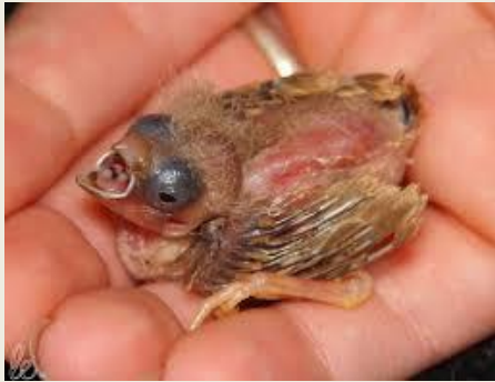
Life Cycle of Zebra Finches