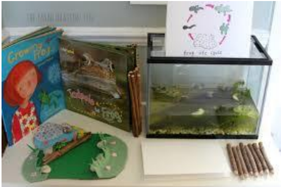
frog investigation tank